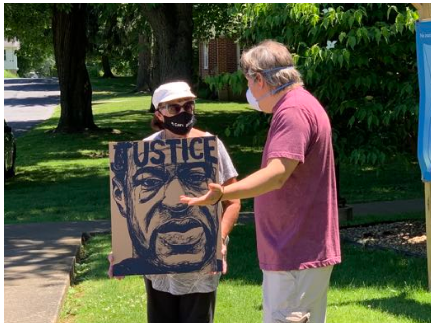
A Vigil for Peace and Justice