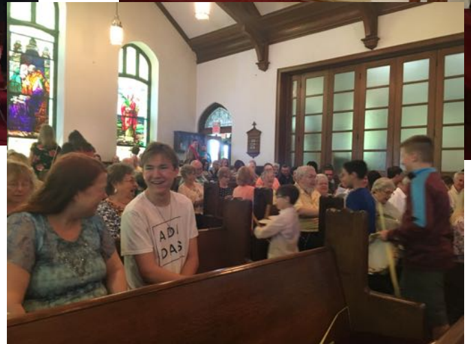
New Member Sunday