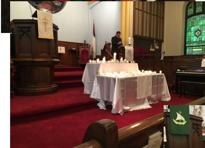
Celebration of All Saints Day and Reformation Sunday