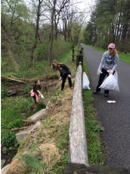
Earth Day Clean Up