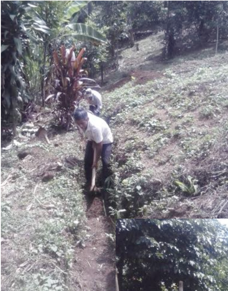
construction in Monte Margarita