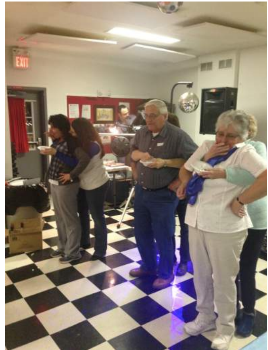
.....and having fun!