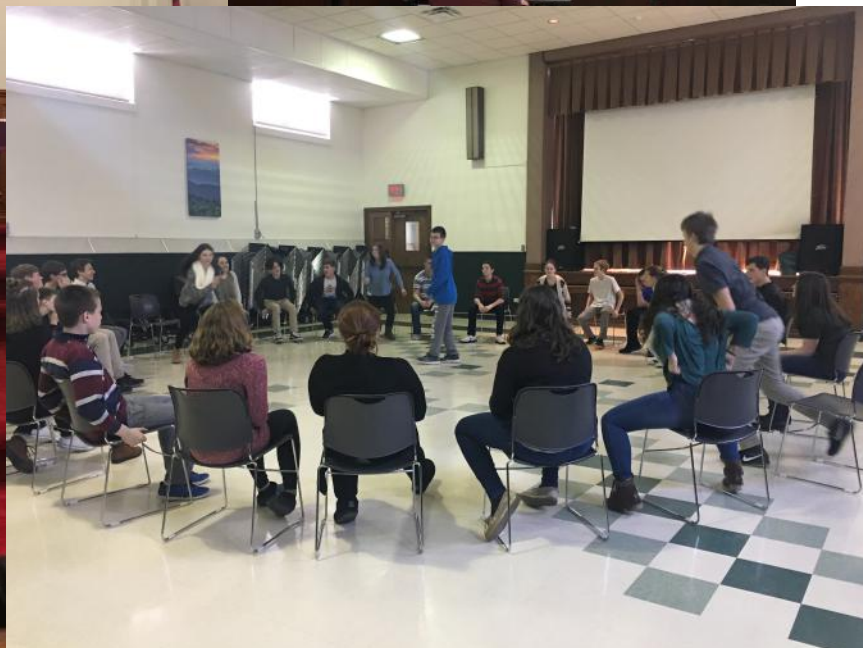
Confirmation field trip